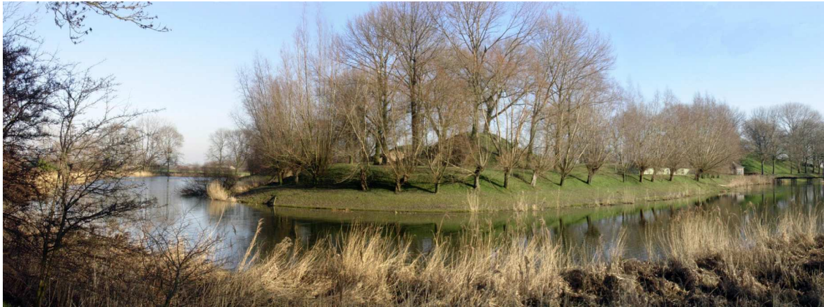
Figure 2 – Pollard willow of Fort Nieuwe Steeg. Pollard willow provided camouflage and cover.

The vegetation not only had a defensive purpose. Trees next to guard-houses provided shade for the soldiers standing on guard. Coppice of willow and alder on the moat banks was used to prevent erosion from the water. Coppice and shrubs also reduced the damage to earth structures caused by hostile fire. If a fortification was under siege the trees and shrubs provided firewood .