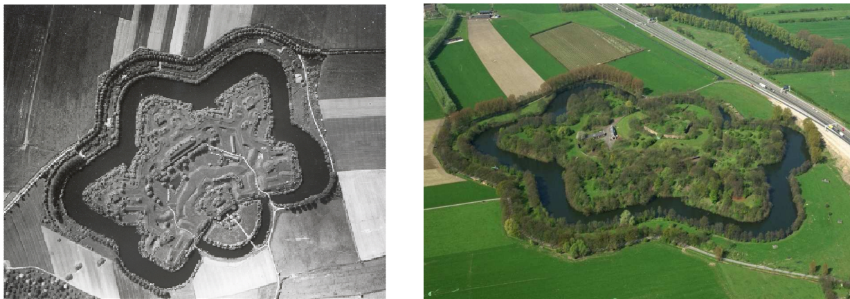
Figure 4 – Aerial photographs of Fort bij Vechten in 1926 (left) and 1997 (right)

Fort bij Vechten is a fortification of 17 ha. It was built between 1867 and 1870. Initially the fortress was covered with grass sods. Spots that were not suitable for applying sods were sown with ryegrass ( Lolium spp. ). In 1879 the War Office gave orders to establish defensive vegetation on the fortress. In 1880 specifications were made to plant 15 sycamore trees, 15 common horse chestnuts ( Aesculus hippocastanum ), 15 red oaks ( Quercus rubra ) and 15 lime trees ( Tilia spp. ) on the inside of the fortress (Terre-plein). On the banks 400 white willows and 8000 thorn-bushes for hedges were planted. The specifications also included the planting of 13.000 sycamore trees for coppicing and 50 elm trees on the glacis. The access road was planted with 250 oaks. In the next years 1892 and 1899 several specifications were made for the maintenance of this vegetation. These specifications show that in 1899 the fortress contained 2.2 hectares of coppice, 1250 meters of hedges, 13.114 metres of coppice on banks and slopes, 387 old trees and 165 young trees. An inventory made in 1909, showed that the defensive vegetation was still intact. However, aerial photographs taken in 1926 show that part of the defensive vegetation has been cleared, this was presumably done during the mobilization in World War I.